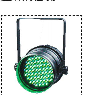
ILED PAR 56LB-015