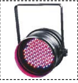
ILED PAR 64LB 015