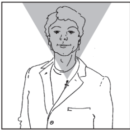
Fig. 4: Microphone pickup angle.