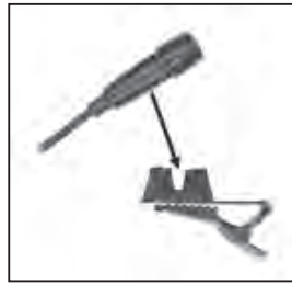
Fig. 2: Fixing the microphone on the clip.