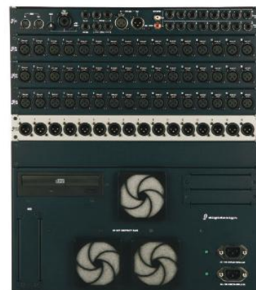
Mix Rack back panel

Corporate Headquarters 800 949 AVID (2843)