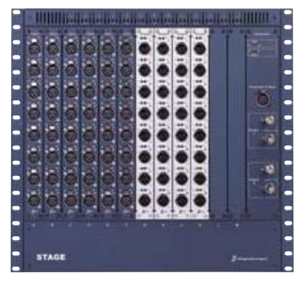
Stage Rack back panel