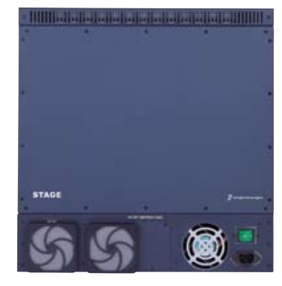
Stage Rack front panel

D/A 24-bit delta sigma, 128x oversampling