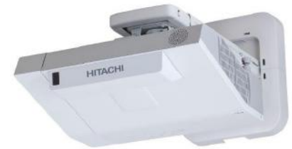
Wall Mounted (with cable cover)