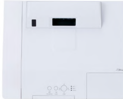
Top View (with cable cover)