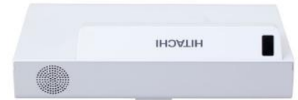
Front View (without cable cover)