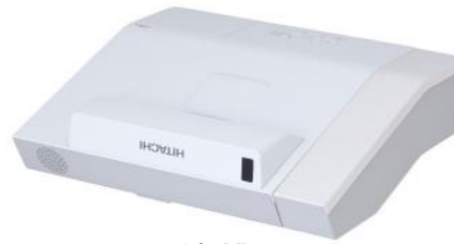
3/4 View (with cable cover)

resolution, the CP-AW3506 provides the perfect compatible solution. It also features a high contrast ratio, long lamp life, cloning function enabling you to copy settings data from one projector to others of the same model, and is wireless presentation ready. Plus, embedded networking gives you the ability to manage and control multiple projectors over your LAN (scheduling of events, centralized reporting, image transfer, and email alerts). Best of all, the high performance CP-AW3506 is exceptionally reliable and offers a very low cost of ownership.