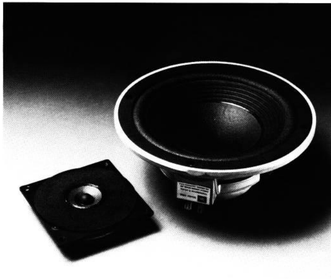
Loudspeaker system components of the 4301 Broadcast Monitor

Frequency response of the 4301 taken with 1/3 octave band pink noise. Measured response contour of a typical system averaged through an inclusive arc of 30° in the vertical and horizontal planes does not deviate more than 3 dB from the above curve.