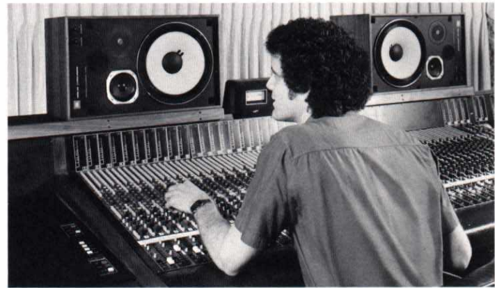
Photographed at Westlake Studio, Los Angeles, Calif.

One reason studios choose JBL (in addition to the good sound) is that JBL loudspeakers are simply built better. The attention to detail is obvious when you look at the oiled walnut