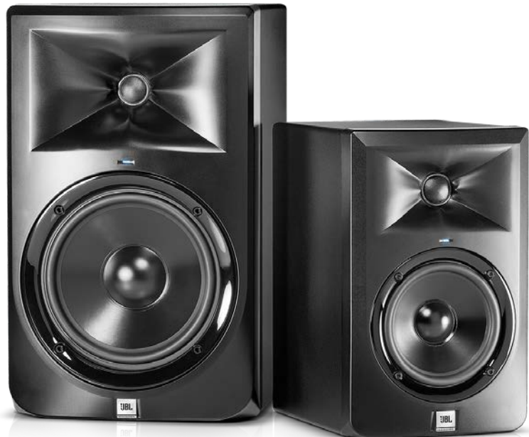
LSR308 8" POWERED STUDIO MONITOR