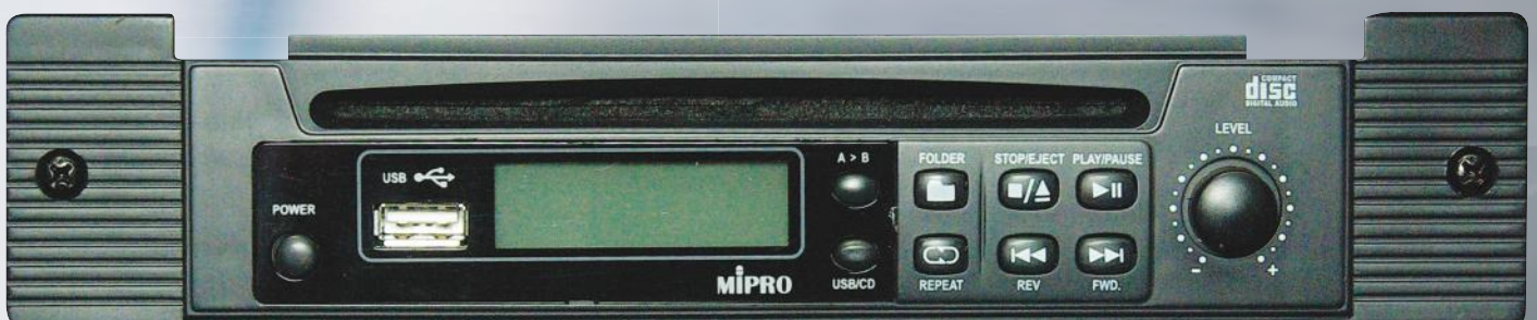
CDM2P CD/MP3/USB player module