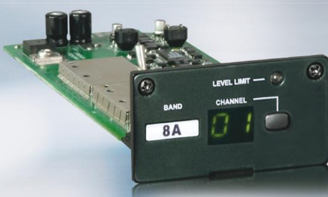
MT-90 Wireless Interlinking Transmitter