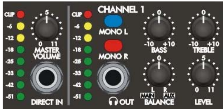
FIGURE 1 - Master Input and Channel One