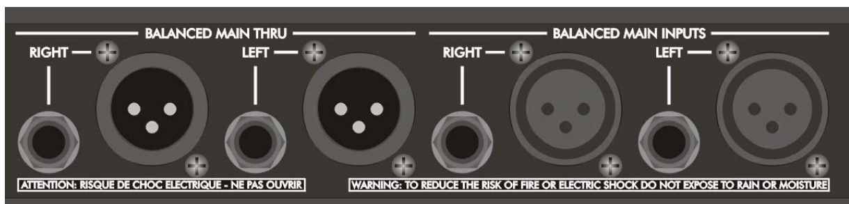
FIGURE 2 - Rear Panel Inputs