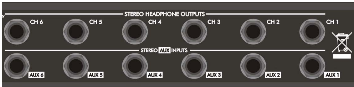
FIGURE 3 - Rear Panel Headphone Outputs and Aux Inputs

These XLR and 1/4-inch TRS jacks are hardwired in parallel with the corresponding BALANCED MAIN INPUT jacks. The BALANCED MAIN THRU jacks are useful for daisy chaining multiple HeadAmp 6 Pro units together.