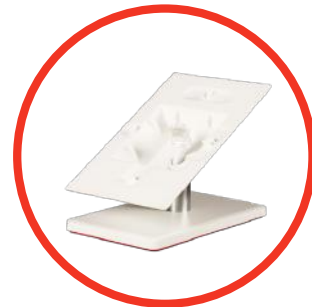
TEC-X-TM Table mount

Biamp and Apprimo are either trademarks or registered trademarks of Biamp Systems, LLC in the United States and other countries. Other product names referenced may be trademarks or registered marks of their respective owners and Biamp Systems is not affiliated with or sponsored by these companies.